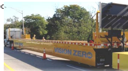
Highly Mobile Barrier

Portable Positive Protection – An easily transportable device that provides both longitudinal and lateral protection for road workers and crash protection for road users. Positive protection is defined in FHWA regulations as devices which contain and/or redirect vehicles and meet applicable crash standards (such as crashworthy movable barrier). 3 Movable barrier includes movable concrete, movable steel, and highly mobile barriers such as the one shown on the right. Highly mobile and movable steel barrier are described in more detail later in this guide. Movable concrete barrier is discussed below.