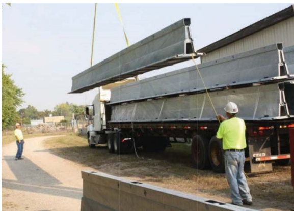
Steel Barrier Installation

As an example, when a lane is closed for a short-term work zone at night for overhead bridge painting, workers may be behind a tarp without good visibility and exposed to approaching traffic. Steel barrier sections can be staged on the shoulder, and, depending on whether the product is equipped with wheels, workers can easily roll sections into place for protection. The barrier can then be rolled to the shoulder by workers to open the lane to traffic during daytime hours. Steel barrier placement time generally exceeds the window of time needed for short-term or stationary operations that last less than six hours; therefore, another form of positive protection such as highly mobile barriers may be used for activities that meet these time frames.