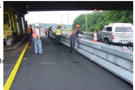
Movable Steel Barrier

Movable Steel Barrier is another type of positive protection device that provides additional portability relative to that of a traditional concrete barrier. It is typically moved from the shoulder or one side of a lane to the other (laterally) and used for long lengths of need and contra flow arrangements. While steel barrier requires heavy equipment to unload it from a truck onto the roadway, once unloaded it is moved relatively easily and can be towed or pushed into place on the ground. Steel barrier may be used for long term projects which span weeks or months, but involve short-term activity locations where the barrier must be placed and removed on a daily basis to avoid peak hour traffic impacts.