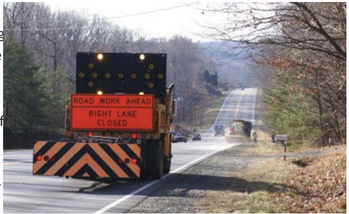
Protective Vehicles with TMAs Provide Rear (Longitudinal) Protection

Barrier vehicles can be effectively used with other types of portable positive protection like highly mobile barriers shown at the right. Where heavy commercial vehicles comprise a high proportion of prevailing traffic, some recommend use of heavy barrier vehicles (such as a 50,000 lbs dump truck with signage and TMA) positioned in-lane sufficiently upstream of the work space to allow for skid forward and better protect against a direct rear impact by a heavy commercial vehicle. 6