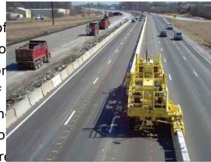
Movable Concrete Barrier & Transfer Machine

Movable Concrete Barrier – This is referenced here for the purpose of drawing a comparison to portable positive protection. Different from this guide’s definition of portable positive protection, this type of positive protection is used where lengthy sections of lanes are opened and closed on a daily or nightly basis or where the work zone is reconfigured daily. A barrier transfer machine (as shown on the right) moves sections of concrete barrier and repositions them from one side of a lane to the other, or from a lane to the shoulder. While this system also provides positive protection, it is important to note the difference between movable and portable in this context. Such movable concrete barrier has higher costs and longer setup time, making it easier to justify on larger, long-term construction projects for providing temporary traffic control and protection, and maximizing traffic flow. Sections of movable concrete barrier can be opened for ingress/egress and/or the same can be used with special gating.