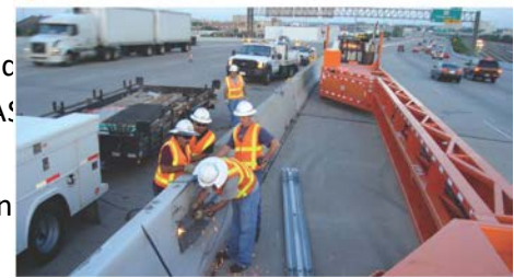
Protected Space Example Mobile Barriers MBT-1