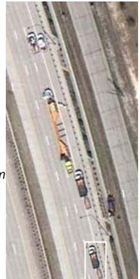
Illustration of In-Lane Barrier Vehicle used with MBT-1